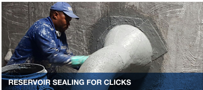
RESERVOIR SEALING FOR CLICKS