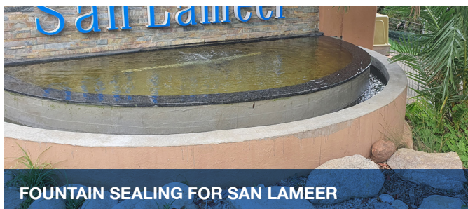
FOUNTAIN SEALING FOR SAN LAMEER

Enviro-friendly Technology, and incorporate these into our Systems, to provide the “Professional Solution”.