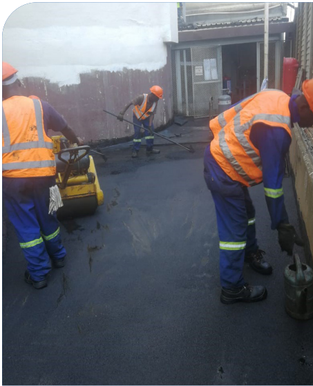
Rescreeded and waterproofed to falls