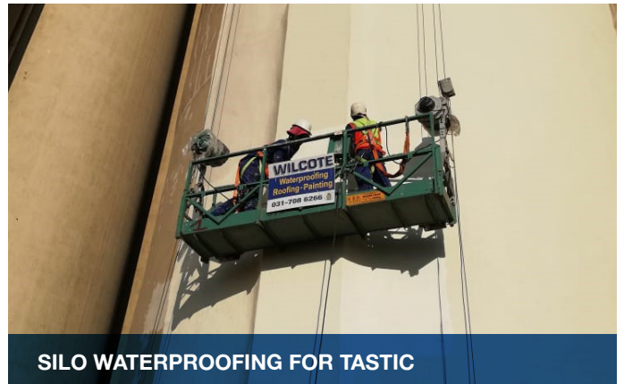
SILO WATERPROOFING FOR TASTIC