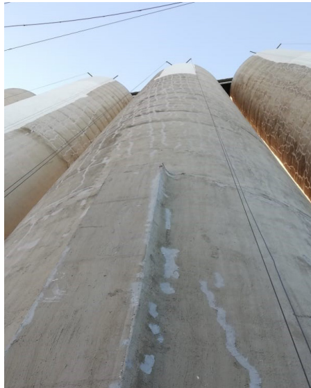
All fissures and cracks filled and area restored